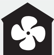
AIR CONDITIONER INDOOR UNIT

Some of these tasks may overlap with furnace maintenance: