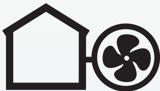
AIR CONDITIONER OUTDOOR UNIT

Maintenance of the air conditioner's outdoor unit is less complex than the indoor unit but still includes multiple steps: